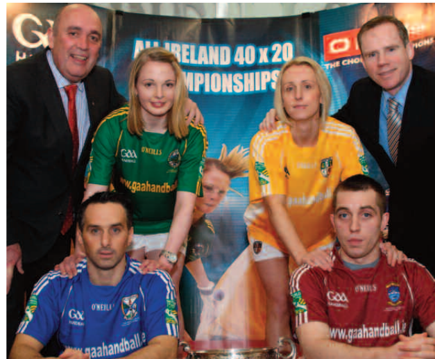
Launching the 2012 O'Neills GAA Handball All Ireland 40x20 Championships at O'Neill's Sports