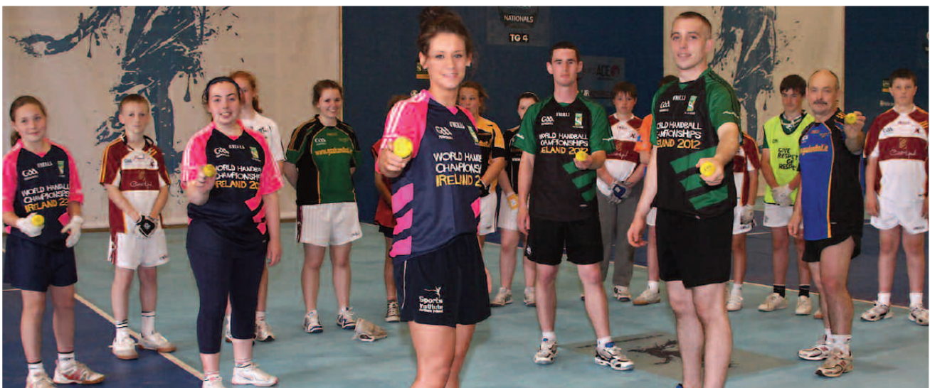
Players enjoy the surroundings at the Citywest at the 2012 One Wall Nationals, launching the courts for Worlds 2012

There has also been tremendous support offered by the Provincial GAA Councils and County Committees around the country. While some of our GAA Handball County and club units may not enjoy the same level of cohesion as others, I have to re-iterate that all our units should continue to engage and work to ensure a stronger bond at all levels of the Association with our many colleagues within the GAA. I can assure all units, in all our gaelic games codes, that we will all benefit from working together in this association.