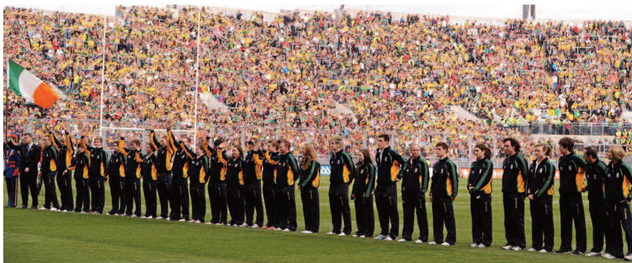
The full Team Ireland squad are presented to the 83,500 spectators at Croke Park on All Ireland football final day, which saw the 2012 World Championships officially launched

One point I feel strongly about also is the fact that Ireland had it's most successful ever World Handball Championships. A total of 72 players from 21 counties won World Championship medals in October and there is no doubt that this statistic can be celebrated. However, I feel it would be remiss of me not to point